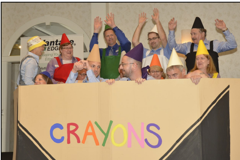
Lunchtime AgVantage Skit! We would like to try to explain why so many staff members are dressed up as crayons, but really, you just had to be there! Perhaps we could just say it has to do with individuality and seeing their true colors? Delightful!